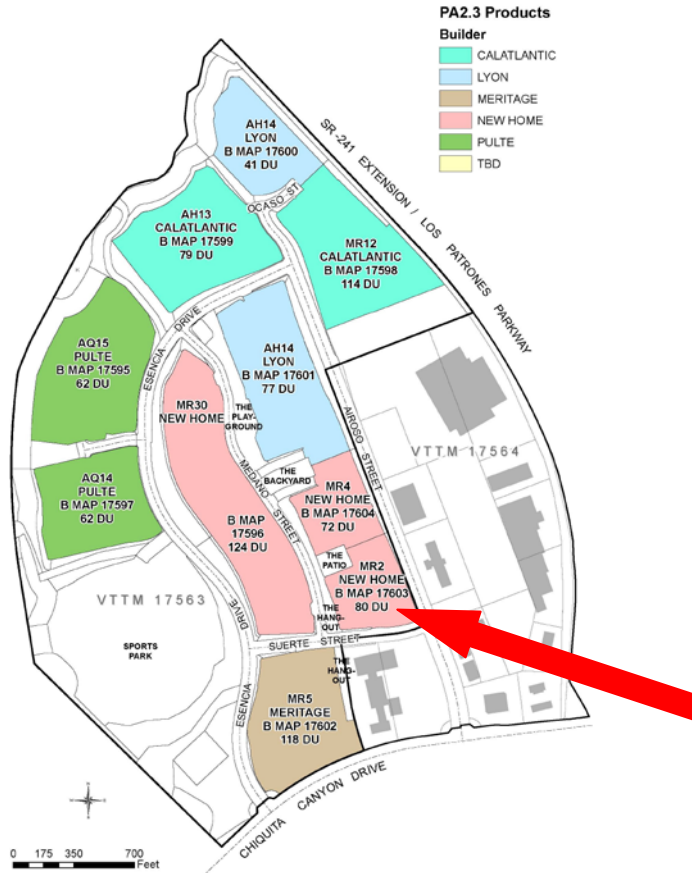
Project Site Map